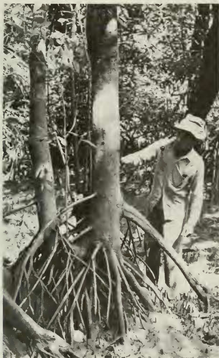
Fig. 7. Avicennia officinalis , showing prop-roots

According to Uphof (1941) A. officinalis has been cultivated (in pots) in the Hamburg Botanical Garden, Germany. Chapman (1970) proposes the ecologic association Avicennietum officinale . The embryology of the species is thoroughly discussed by Padmanabhan (1964): "The first division of the primary endosperm nucleus is followed by a transverse wall. The upper chamber again divides transversely leading to the formation of a row of three cells including the primary chalazal chamber which forms a unimucleate